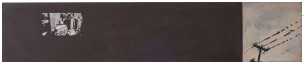
trying to forget , gesso on oil and board, 200 x 40 cm, 2008