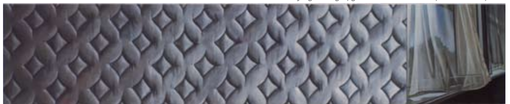
the bed we made , gesso on oil and board, 200 x 40 cm, 2008

✦ Bronwen paints objects from her environment on gesso canvas – a dark layer underneath and a lighter one over. She then tackles it with sandpaper until it appears as if the image rises up from layers of earth; like something dug up and weathered by time. This imagery “addresses the physical and emotional spaces that people occupy”. These spaces, she says, form our identities on a personal and socio-political level.