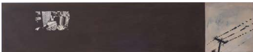
trying to forget , gesso on oil and board, 200 x 40 cm, 2008