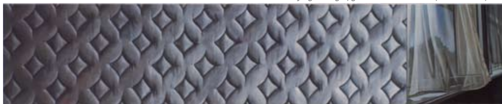
the bed we made , gesso on oil and board, 200 x 40 cm, 2008

✦ Bronwen paints objects from her environment on gesso canvas – a dark layer underneath and a lighter one over. She then tackles it with sandpaper until it appears as if the image rises up from layers of earth; like something dug up and weathered by time. This imagery “addresses the physical and emotional spaces that people occupy”. These spaces, she says, form our identities on a personal and socio-political level.