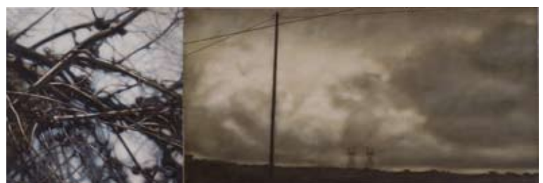
Last Hour , oil on canvas, 210 x 70 cm, 2008

✦ Deanne Donaldson’s new work follows a recent exhibition in which she struggles with personal loss. Her paintings recall old emotions from the memory. These are landscapes where the inside is turned out. She’s fascinated by light, especially how light is observed when emotions interplay – emotions like mourning and shock. Some of the presentations have been photographed with a cellphone camera, over a period of four months.