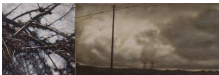
Last Hour , oil on canvas, 210 x 70 cm, 2008

✦ Deanne Donaldson’s new work follows a recent exhibition in which she struggles with personal loss. Her paintings recall old emotions from the memory. These are landscapes where the inside is turned out. She’s fascinated by light, especially how light is observed when emotions interplay – emotions like mourning and shock. Some of the presentations have been photographed with a cellphone camera, over a period of four months.